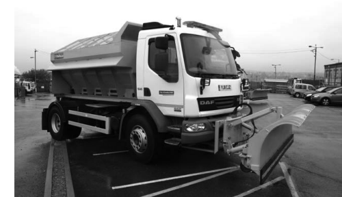
Issued January 2017 - Revision 1

Inline with the Council's Health and Safety responsibilities, Driving Procedures, good management practice along with the nature of the service (laying road salt) and the complexity of the equipment, driver familiarisation training and